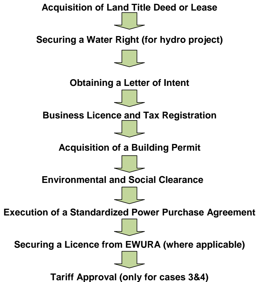
Figure 2: The Sequences of implanting an SPP:

The sequences of implementation of an SPP can be summarized as in figure 2 below: