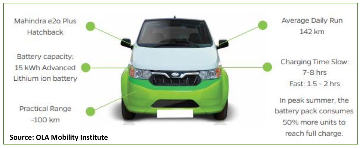
Figure 4: e-car specifications

India's shared mobility market has undergone significant transformation with the introduction of app based services like OLA and UBER and has also increased the usage of passenger cars as one of the major mode of public transport in the metropolitan cities like Delhi, Mumbai, Kolkata, Bangalore etc. In addition, various app based delivery services like Grofers, BigBasket are using four wheeler goods carrier for delivering goods to their customer. Therefore transition to electric vehicle for these commercial fleet will have significant impact on the electric vehicle uptake and consumer awareness. Moreover, the shared mobility services owing to their higher daily distance coverage will contribute significantly to the fuel savings and greenhouse gas emission factor which are considered as the major drivers of electric mobility transition.