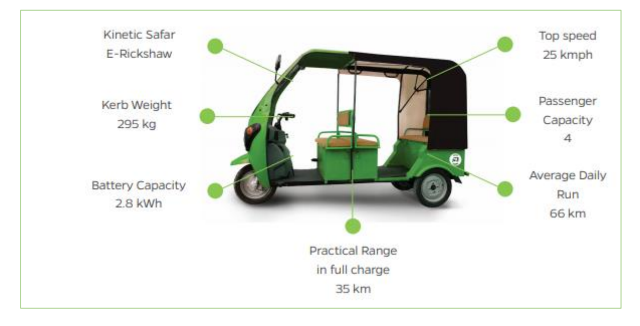
Figure 2: e-rickshaw Specifications

Moreover, in India's strive towards electric mobility, e-rickshaw is the segment which has gained maximum momentum with more than 2 million e-rickshaws currently running across the country. Considering the extent of adaptability in many parts of India, in 2015 Govt. of India has amended the Motor Vehicle Act, 1988 and allowed exemption of license for e-rickshaws having seating capacity of 5 persons and motor power rating of up to 4000 watt (4kW) which made it easier for the segment to grow. Recently, Ministry of Road, Transport and Highways (MoRTH) directed Transport Commissioners of all the states and Union Territories to allow sale and registration of EVs (electric two and three wheelers) without batteries as de-linking of battery cost from the vehicle will reduce the upfront capital cost of three wheelers by 30% to 40%.