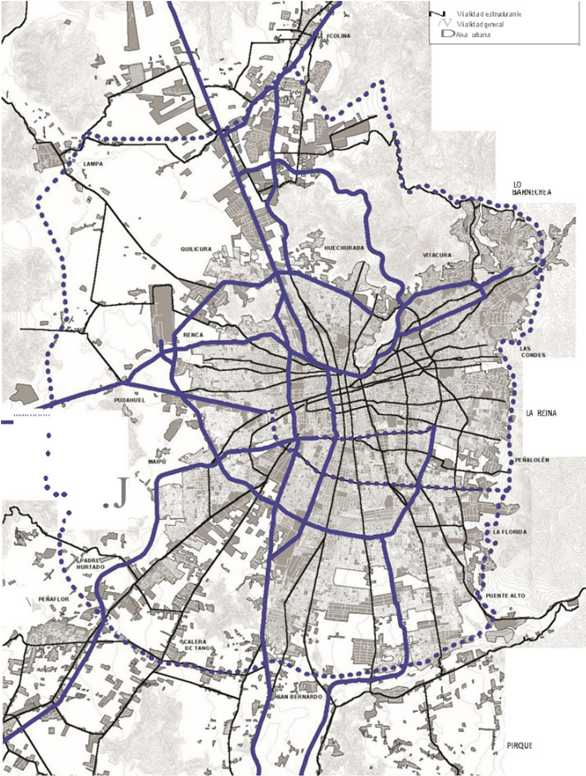
Figure 2. System of urban highways, Santiago, Chile