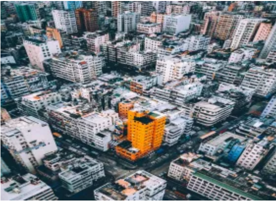
Performance of Asset Recycling)