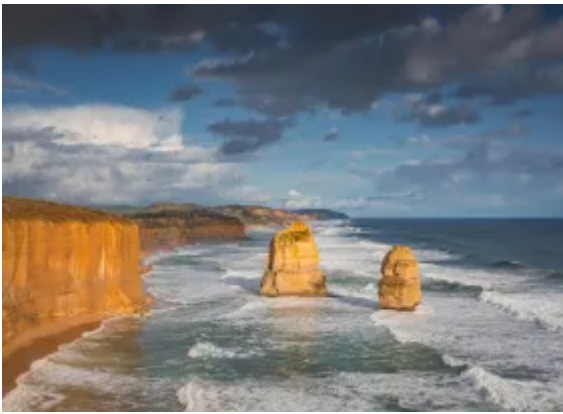
rough Renegotiation and Energy Regulation