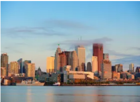
ovements to Victoria Water Desalination Plant

United States, Maryland – I-495 and I-270 PPP Project