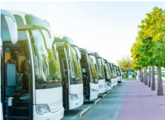
Hong Kong SAR, China