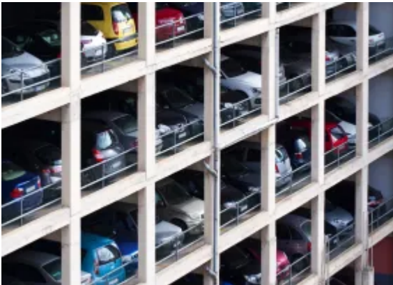
Project, Western Australia, Australia