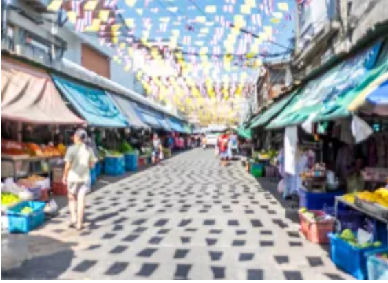
Ngurah Rai International Airport, Bali, Indonesia