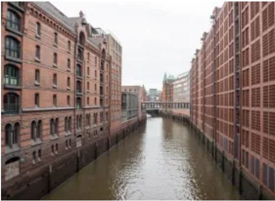
Elbphilharmonie, Hamburg, Germany