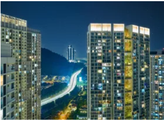
California, United States