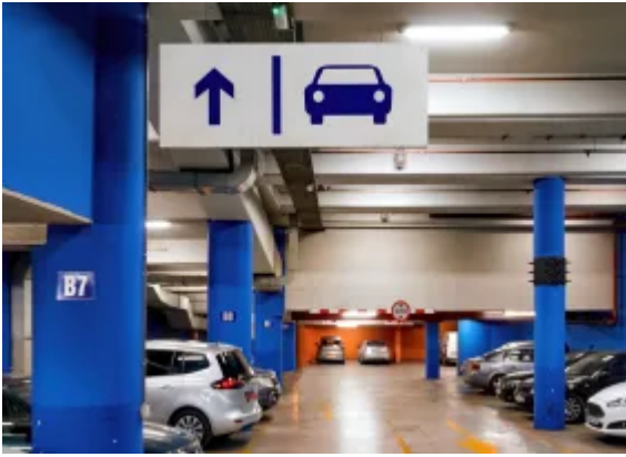
San Isidro, Peru