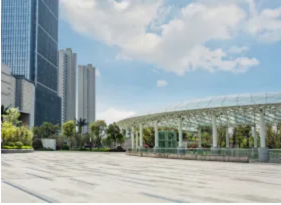
California, United States