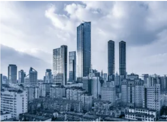
ia, United States