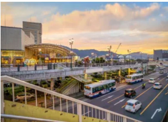
San Pedro Sula, Honduras