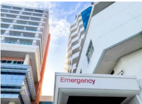
Majadahonda's Puerta de Hierro Hospital, Madrid, Spain