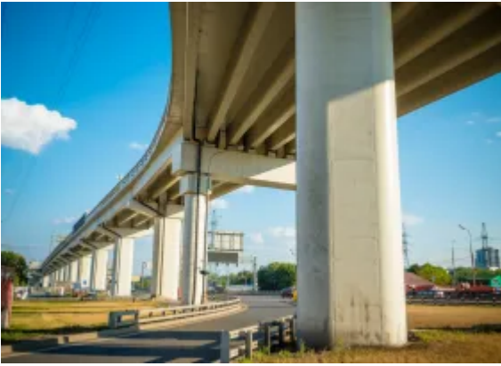
Ethekwini, South Africa