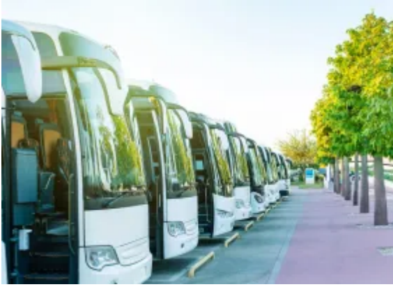
Hong Kong SAR, China