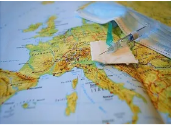
: Resumption of foreign direct investment