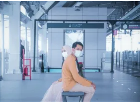
coming and ongoing PPP tenders