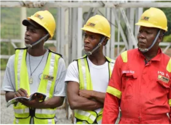
must act to protect projects