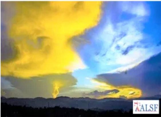
Republic of the Congo