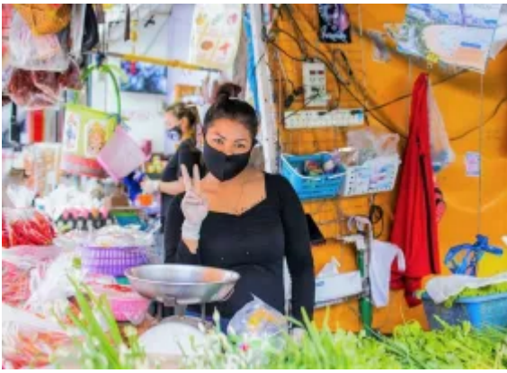
COVID-19 in Asia and the Pacific