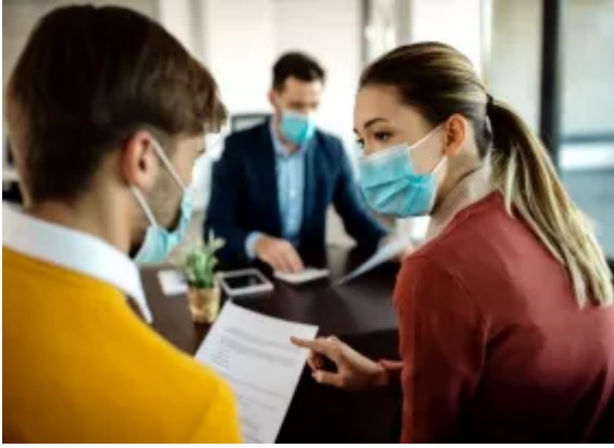
COVID-19 (coronavirus) Pandemic