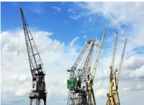
Concessions Build-Operate-Transfer (BOT) and Design-Build-Operate (DBO) Projects